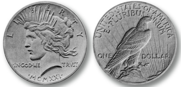
▲ THE ORIGINAL PLASTERS presented by Anthony de Francisci to the design committee were the unanimous winners of the competition. He was directed to prepare the finished models under the direction of sculptor James Earle Fraser.

According to the Smithsonian Institution, the