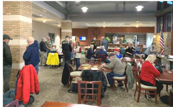
Mountain Coin Club Holiday Dinner on December 10, 2024

The club held its annual holiday dinner at the Dec. 10 meeting in Blairsville, Ga. About 30 people attended, with the club providing the food and drinks.