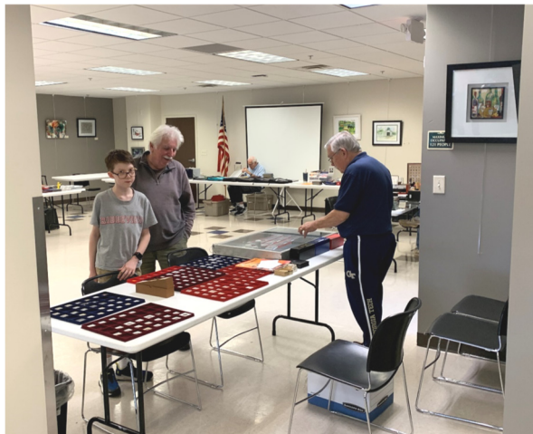
MCCA Bourse Night November 2, 2024

MCCA held its first club bourse night on Saturday, Nov. 2, in Dunwoody, Ga. Eighteen tables were sold to club members for the bourse night. It was held from 4 to 8 p.m. Members of other coin clubs and friends were also invited to attend.